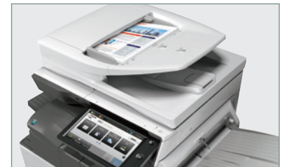
Sharp's ImageSEND™ feature provides one-touch distribution to email, cloud applications and more.