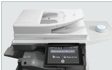
MX-4051 shown with available Sharp MFP Voice feature with Alexa.