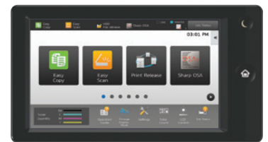
Award-winning 10.1" (diagonally measured) customizable touchscreen display.