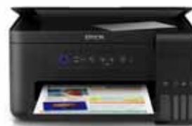
EcoTank L4150 All-in-One Printer

The design of the new EcoTank printers makes them sleek and compact. With the tank integrated into the printer, these printers have the smallest footprint* amongst all brands of ink tank printers. Enjoy spill-free refilling with individual bottles which have unique nozzles that fit only into their respective tanks. Auto-duplex printing** affords users up to 50% savings on paper costs by printing automatically on both sides of paper. Remain connected with the option to print wirelessly over network or directly from your mobile devices using Wi-Fi Direct. Rejoice in exceptional print quality with the use of pigment black ink which produces water and smudge-resistant printouts.