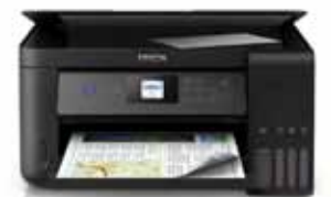
EcoTank L4160 All-in-One Printer