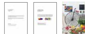
#1 Black Text #2 Black Text and graphics #3 Photo 4R (4" x 6")

†1 Print speed (Pages Per Minute) is calculated when printed on A4 plain paper in the fastest mode, 10 cm x 15 cm photo print speed when printed on Epson Premium Glossy Photo Paper. Print speed may vary depending on system configuration, print mode, document complexity, software, type of paper used and connectivity. Print speed does not include processing time on host computer.